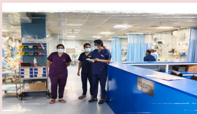
Medicine Block Ward 25