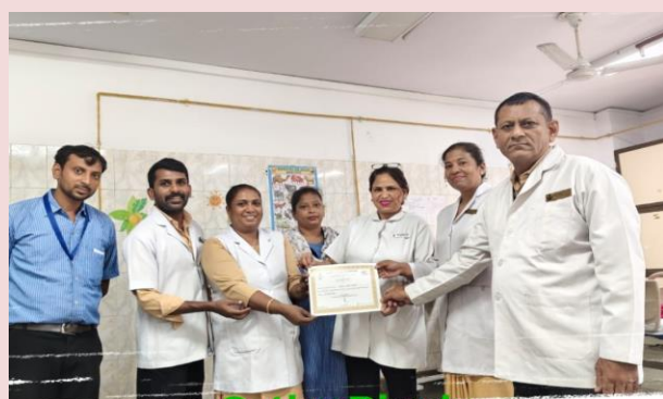
Ortho Block Ward 4B

Pictures of certification of various Cleanest Wards—