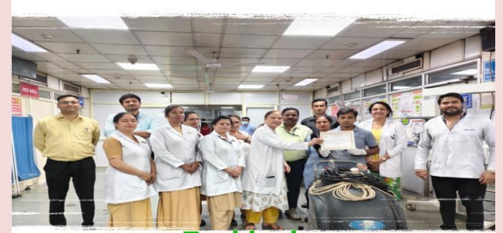
Em block Casualty