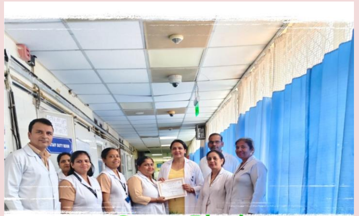
Gynae Block PNW 1