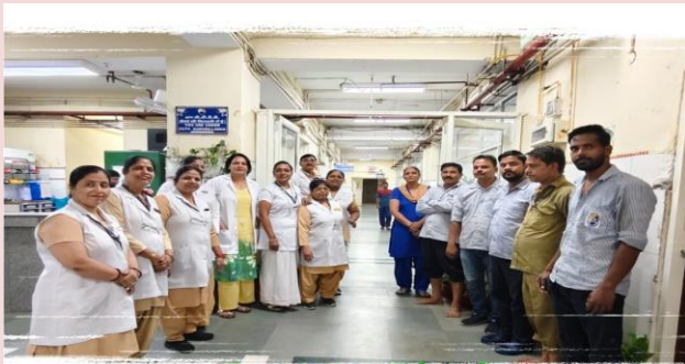
Surgery Block Ward 4B